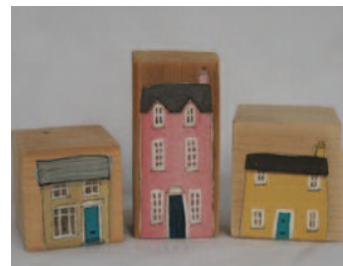
Sally's Shed Wood www.sallysshed.co.uk