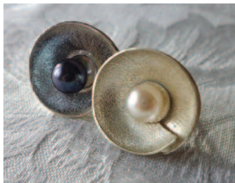
Romayne Curzon Jewellery www.romayne-curzon.webs.com