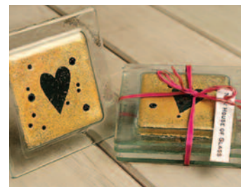
NJW House of Glass Kiln formed glass www.njwhouseofglass.co.uk