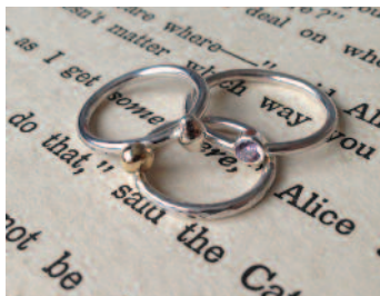
Busy Budgie Jewellery Silver and Gold Jewellery www.busybudgiejewellery.com