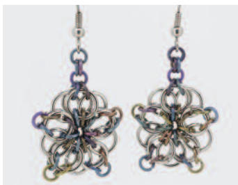
Anjo Designs Jewellery www.anjodesigns.co.uk