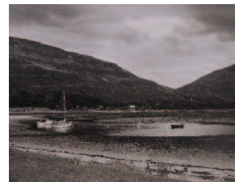
Natasha Braithwaite Black & white photography and darkroom printing Facebook Page: Tash Braithwaite