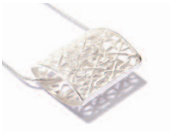
Kate Holdsworth Designs Jewellery with a textile theme www.kateholdsworthdesigns.com