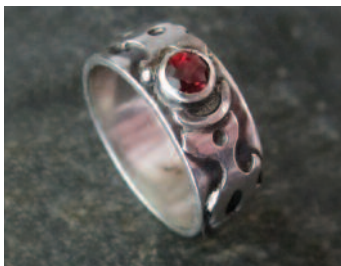
Beyond Bling Jewellery www.beyondbling.co.uk