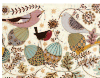
Helen Rhodes Mixed media paintings, prints, greeting cards, china products, ceramic brooches, notebooks www.helenrhodes.com